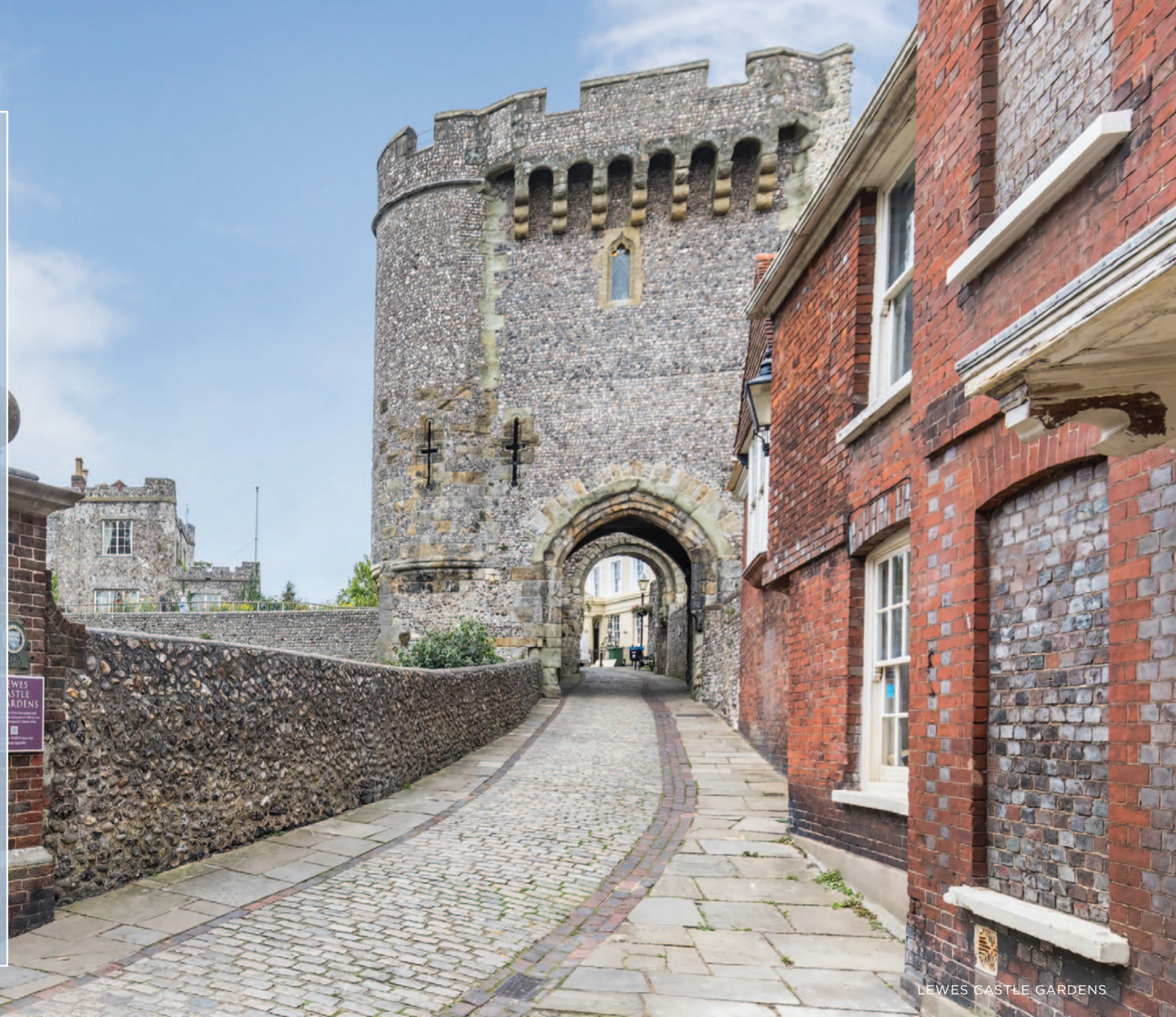
LEWES CASTLE GARDENS

Lewes is famous for its beautiful Norman Castle, which towers over the High Street along with Anne of Cleves House, part of the annulment settlement for Queen Anne from Henry VIII. The character of Lewes is such that it can boast the first assembly of Parliament!