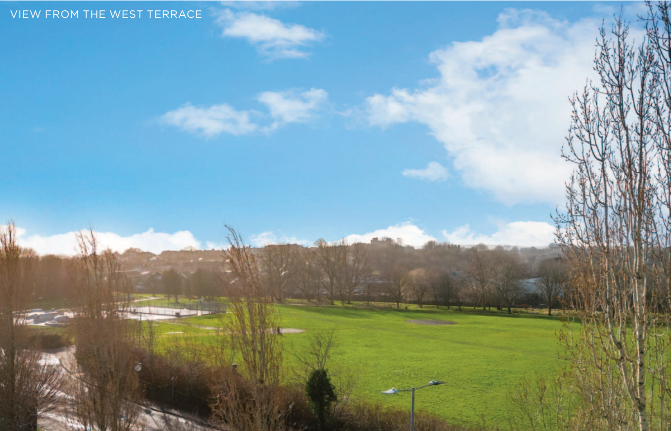
VIEW FROM THE WEST TERRACE